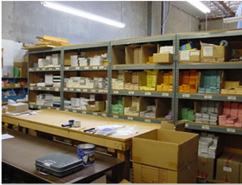
Literature Distribution Area of RSO Office