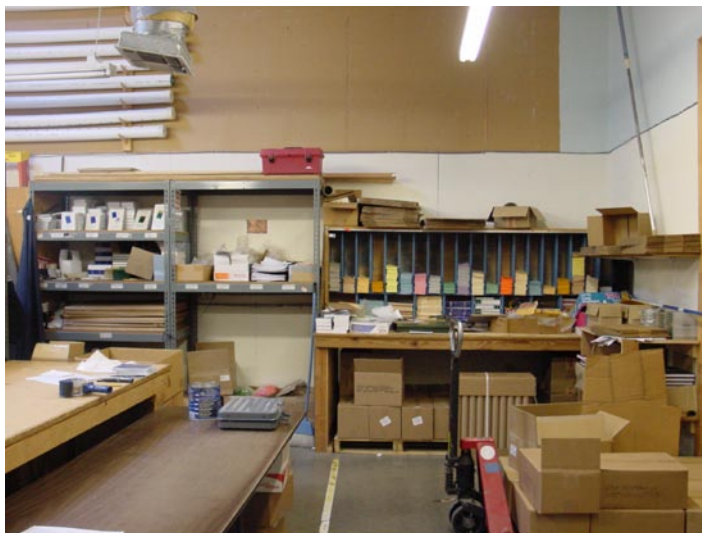
Literature Distribution Area - NCRSO

To archive previous NCCNA convention workshop and speaker tapes to a new format to insure permanency.